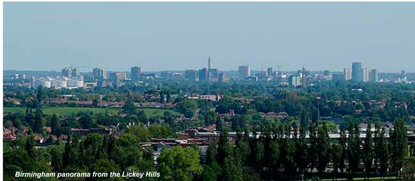
Birmingham panorama from the Lickey Hills

UCI BMX WORLD CHAMPIONSHIPS BIRMINGHAM 2012